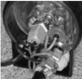
Figure 24 (External Power Supply)